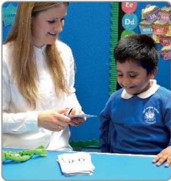
Learning the Speed Sounds in the classroom.